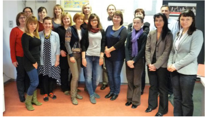
BERLIN, GERMANY (8-9 APRIL 2014)