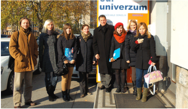
LJUBLJANA, SLOVENIA (2-3 DECEMBER 2013)